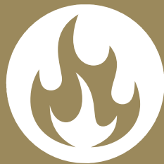
Fire and Smoke